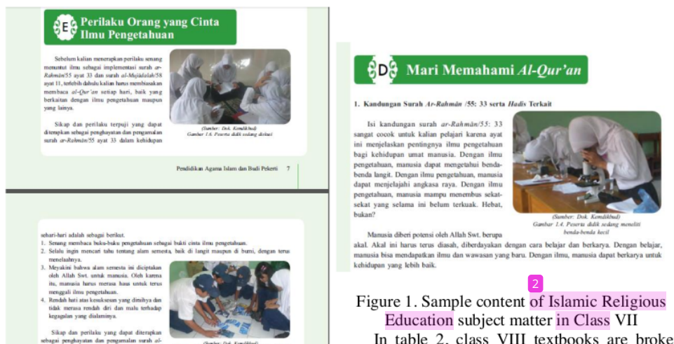
Figure 1. Sample content of Islamic Religious Education subject matter in Class VII

Based on table 1 above, it can be described that of the 13 theme items presented in class VII, there are three issues: seven moral issues, four tolerance issues, and two historical issues. For example, although Chapter I. the subject "With knowledge, everything becomes easier," The chapter raises an issue that focuses more on the moral aspect. One illustration of the contents of the book can be seen below: