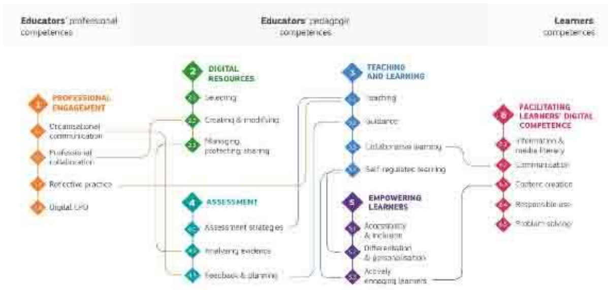
Figure 2. Digital Teacher Competence and Relation(Redecker, 2017)

a result of the emergence of digital tools and opportunities for this medium Development, Development will most likely continue, as will efforts to consolidate concepts under one definition. not only is it impossible, but it will also quickly lose its relevance. Ala-Mutka proposes different explanations for the apparent shift toward the use of digital competence, arguing that it reflects a broader shift in education toward computer languages.