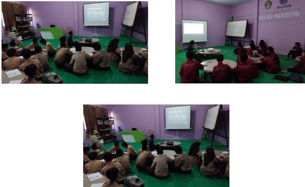
Figure 1 Internalization of Religious Moderation Values through Islamic Religious Education Learning at NU Mekanika Vocational School

These findings reinforce the importance of pesantren-based education as a model for strengthening religious moderation and character formation among students in contemporary Islamic education contexts.