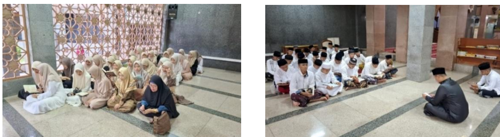
Figure 2 Internalization Activities of Religious Moderation Values through Islamic Religious Education Learning at Akmala Sabila High School at the Attaqwa Mosque